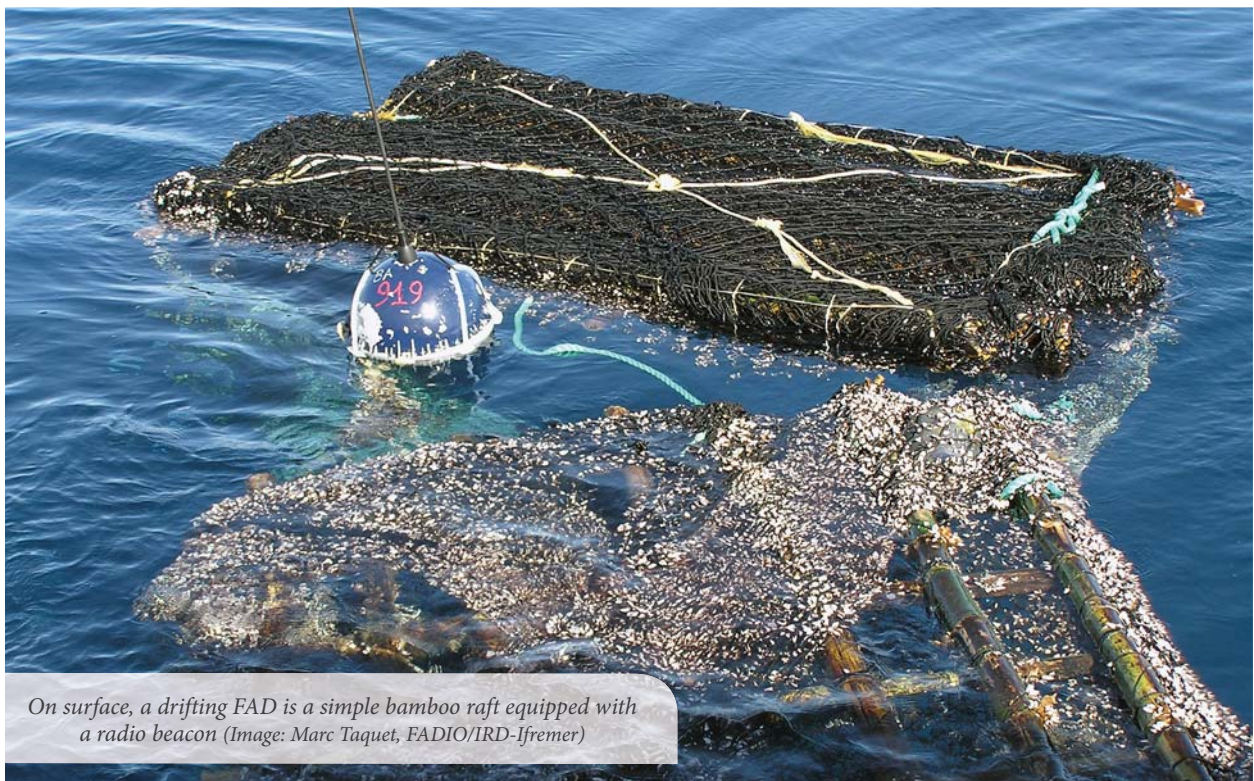
On surface, a drifting FAD is a simple bamboo raft equipped with a radio beacon

While expansion of fishing grounds can help to distribute exploitation over a broader area, it is theorized that previously unexploited areas may represent natural reserves or “stock sinks” that help to replenish heavily exploited areas. Drifting objects tend to aggregate particular species or life stages that can contribute to differential exploitation with negative ecological impact.